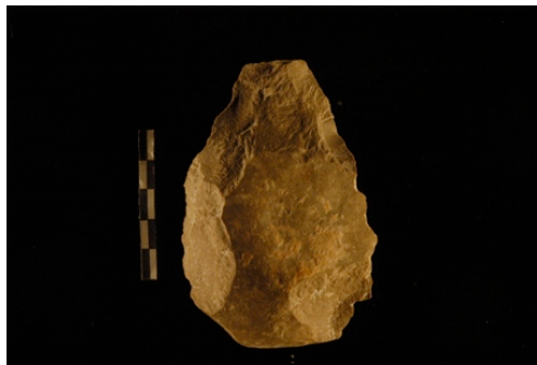
Cueva Negra hand-axe

June 30 th – July 21 st 2017 at Cueva Negra del Estrecho del Río Quípar (Session 1), July 21 st – August 11 th 2017 at Sima de las Palomas del Cabezo Gordo (Session 2)