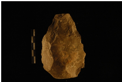
Cueva Negra hand-axe