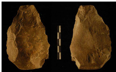
Cueva Negra hand-axe

Murcian Association for the Study of Palaeoanthropology and the Quaternary, MUPANTQUAT, http://www.mupantquat.com