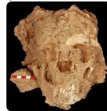
Sima de las Palomas Neanderthal child skull