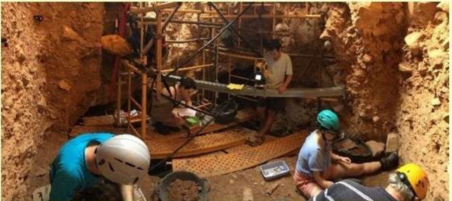
Sima de las Palomas del Cabezo Gordo