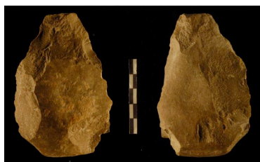
Cueva Negra hand-axe