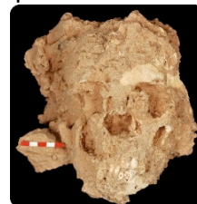
Sima de las Palomas Neanderthal child skull

Excavation has been ongoing for 30 years at both sites. Cueva Negra has abundant evidence of fire, a final Early (i.e. Lower) Pleistocene fauna, an "Acheulian" hand-axe, numerous flake-tools, and extinct fauna in sediments laid down between 990,000 and 772,000 years ago (likely during an interglacial period 868,000-814,000 years ago), according to biostratigraphy, palaeomagnetism, and geophysical dating. Sima de las Palomas has >300 skeletal parts (teeth, bones) of 15 Neanderthal individuals, including 3 articulated skeletons one of which is 85% complete 55,000-50,000 years ago, an early Late (i.e., Upper) Pleistocene fauna, and Mousterian Palaeolithic artifacts, dated by 14 C, U-ser, OSL and ESR, with new finds of Neanderthals teeth and mandible, fauna, and Mousterian artefacts in deep layers dated to 130,000-90,000 years ago.